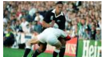
45-29 All Blacks vs England (1995 World Cup)